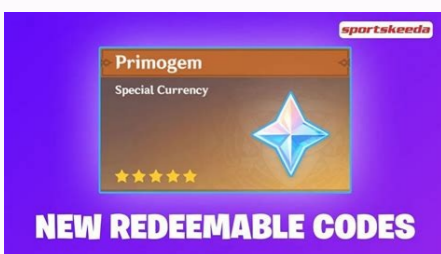
Genshin impact how to use primogems for wishes. Genshin impact primogems use reddit.